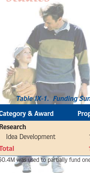
Table IX-1. Funding Summary for the FY03 TSCRP