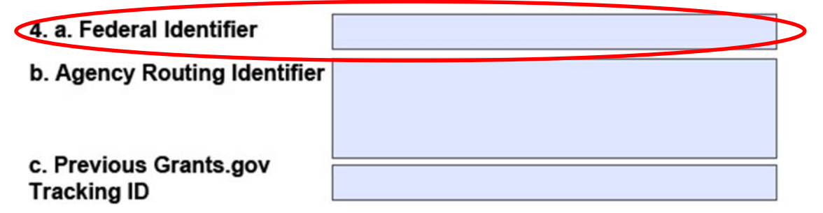
Figure 1. Enter the eBRAP log number in Block 4a.