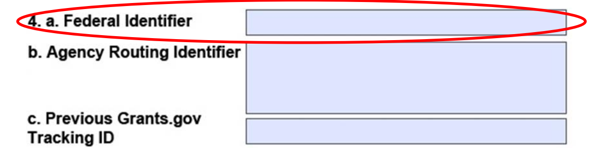
Figure 1. Enter the eBRAP log number in Block 4a.