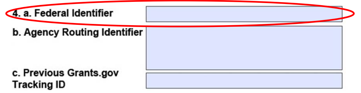
Figure 1. Enter your eBRAP log number in Block 4a.